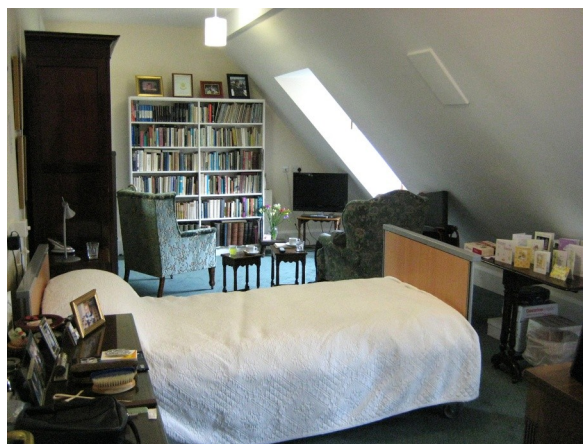
One of the refurbished rooms

Thanks to the generosity of the many donors who were inspired by the Archbishop of Canterbury's appeal, and the support of trusts and other sources, Phase 1 of the College Development Project is complete.