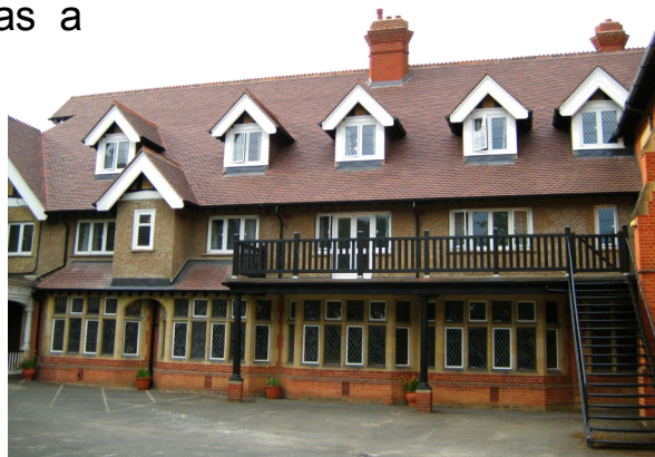
The restored exterior

There has been as much care lavished on the exterior. The oldest part of the Central Block has a