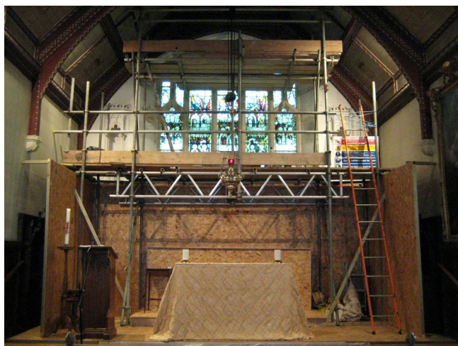
The sanctuary while the works take place

while the exterior is re-pointed and new steel bars are inserted to support the leadwork. On the inside, layers of flaking paint are being carefully removed from the stone mullions before they are repaired and restored.