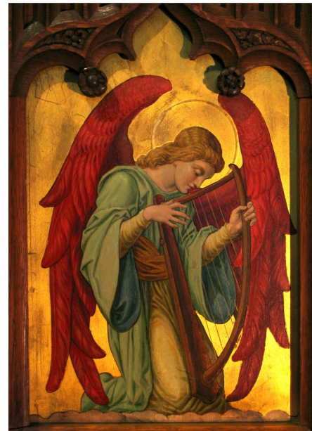
One of the angels from the front of the altar

The beautiful Pre-Raphaelite paintings in the front of the altar (see right ) were also de-mounted and