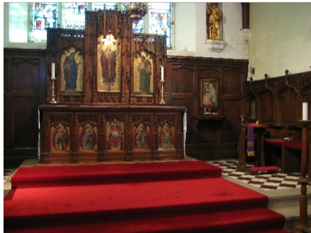
The reredos and high altar before work began

Not only has the first Phase of the development project been successfully completed, but work has begun on the restoration of the Chapel, thanks to the success of last summer's appeal.