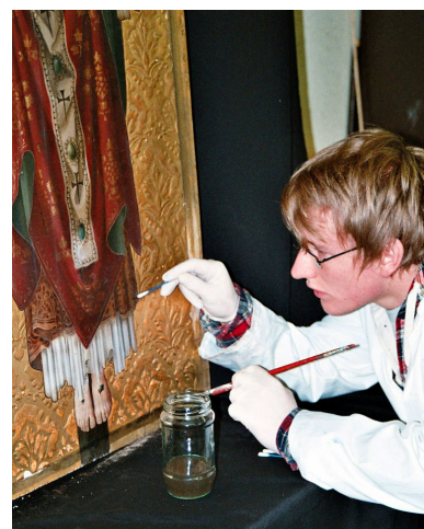
Restoration of the Christus Rex panel

As we reported in the last Bulletin, in May the sanctuary became a hive of specialist activity as the stonework of the window was carefully cleaned, repaired and preserved. The three-panel reredos has also been painstakingly restored and the panels of the altar cleaned and re-gilded. Fine details have been revealed which have not been seen for decades, but it is only when one sees the cleaning in progress that the extent of the transformation can be appreciated.