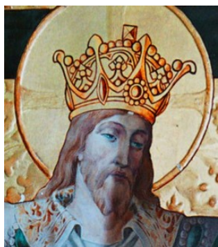
The face of Christ, before (right) and after (left) restoration

The great Kempe window in the Chapel, the reredos and the panels of the altar are now splendidly restored, thanks to the generous response to our appeal.